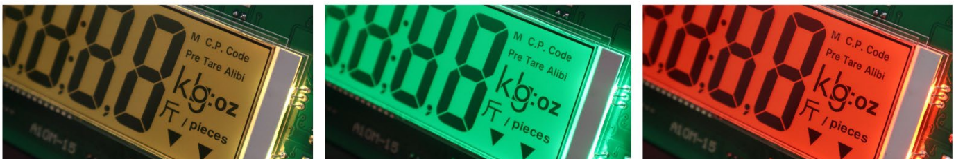
Tri-Color Check Result Backlight for Enhanced Visibility

Versatility, Functionality, and Accuracy are all Built-In